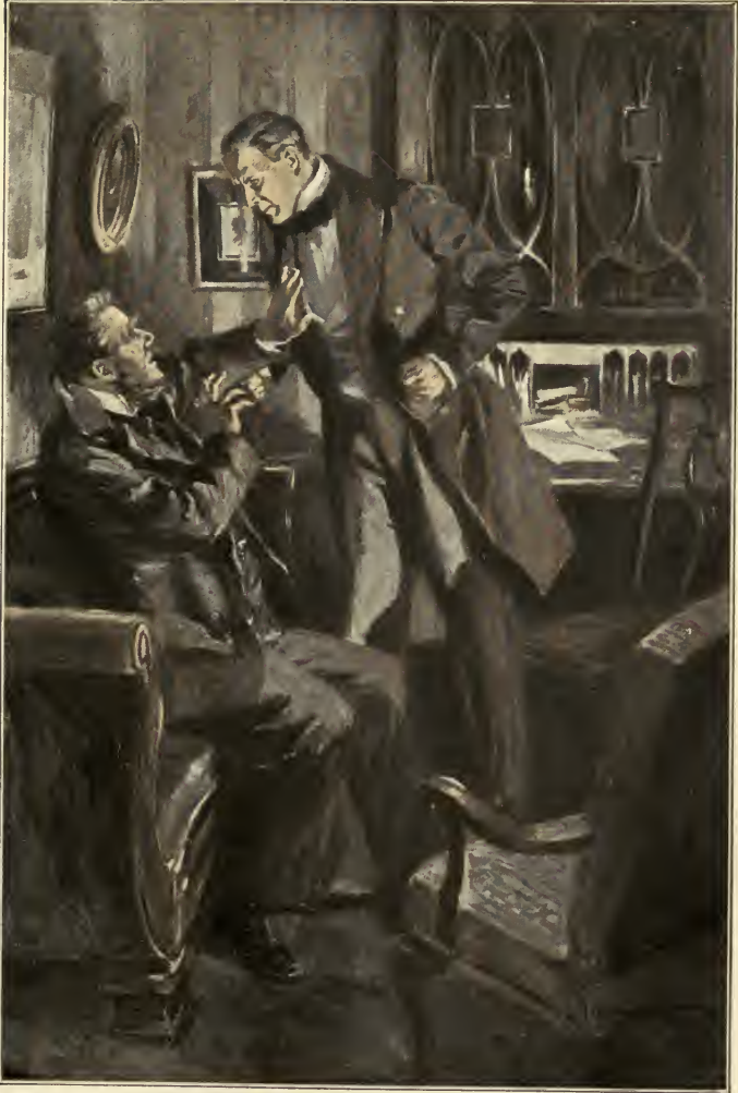
The doctor stood over the captain with eyes blazing and fists tightly clenched.